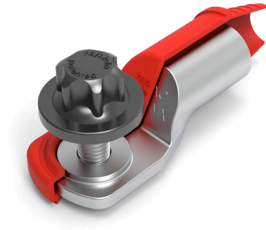
The Lugsulation® Smart with the Torx insulation screw

Lugsulation® Smart, a variation of Lugsulation® Deep, is designed for efficient and secure serial parallel installation on flat terminals and contact surfaces without extra components. This model offers a fully sealed insulation for electrical connections across the terminal to avoid electrical hazards and short circuits.